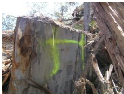
Mogo SF – Habitat Tree 'Retention'

In light of these findings, South East Forest Rescue calls for indigenous ownership of all public native forest, complete transfer of wood product reliance to the plantation timber industry and salvage recycled hardwood timber industry output, a single authority for national native forest stewardship modelled on the New Zealand example and an immediate nation-wide program of catchment remediation and native habitat re-forestation.