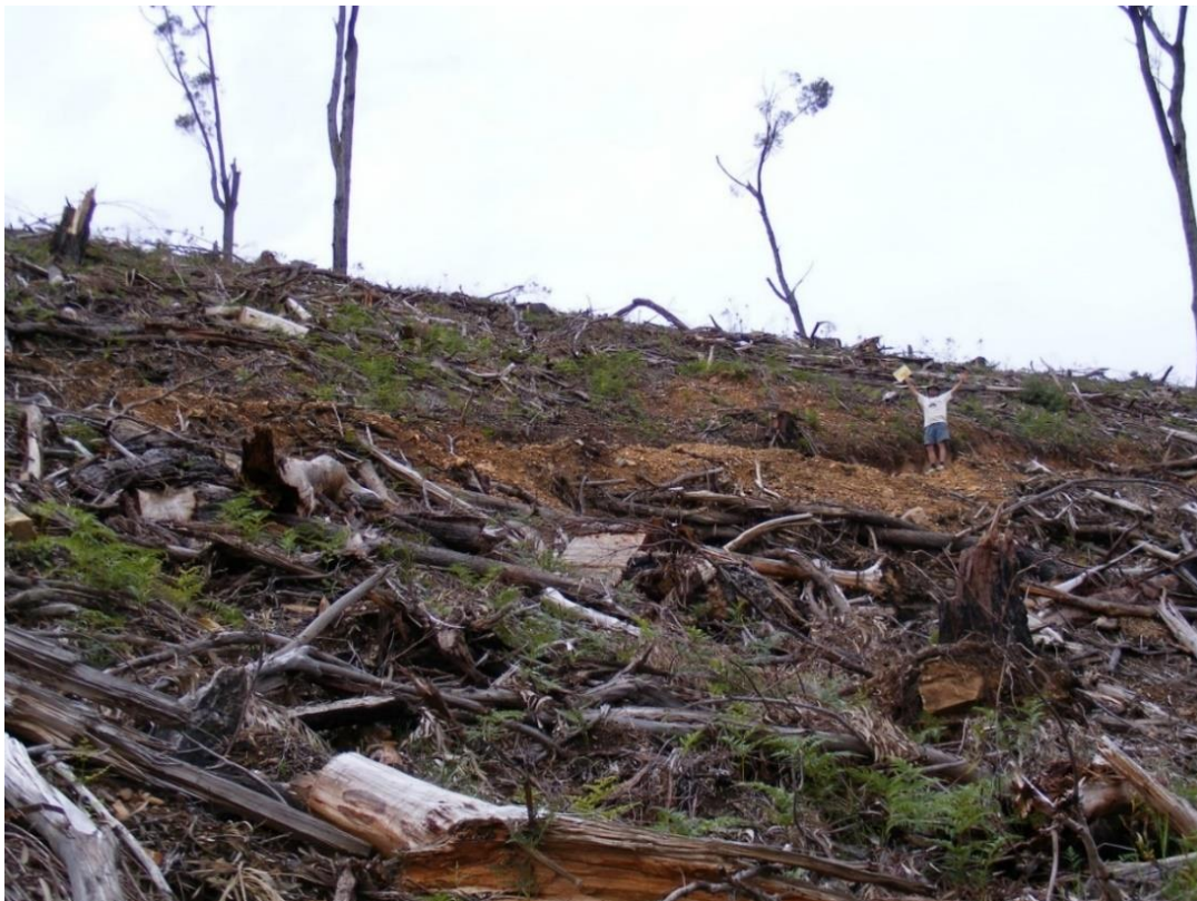
Gnupa SF – 4 trees per 2 hectares. “Gnupa was a mistake”: FCNSW

We assert that urgency is needed in this forest reform. In our view, the RFA experiment has failed.