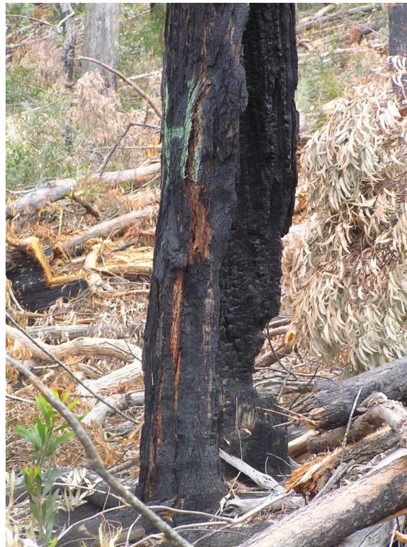
Dampier SF – ‘Habitat Tree’ retained for future generations...

The change in species composition of ecosystems due to the preferential grazing of palatable species is only one effect from grazing. Cloven-hoofed animals have contributed to soil compaction and general degradation of ecological processes by causing the loss of leaf litter and the associated loss of soil micro-organisms and available carbon, reduced soil water infiltration rates and an increase in soil erosion. 174 These effects are particularly pronounced in temperate woodlands. 175